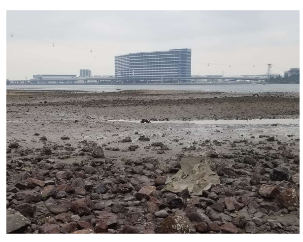
(b) Survey Location at TCB2