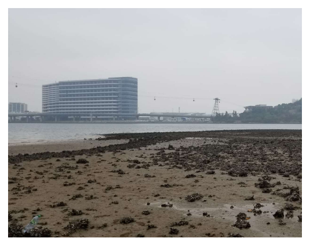
(a) Survey Location at TCB1