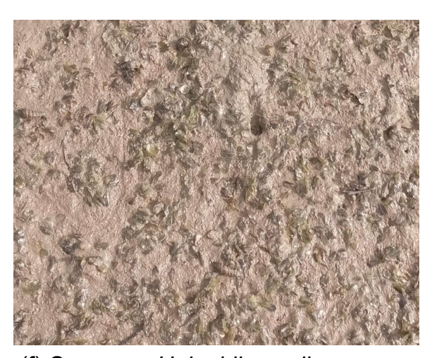
(f) Seagrass Halophila ovalis recorded at TCB3 during the Qualitative Walk-through Survey