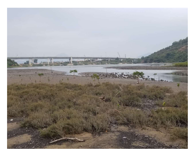
(d) Survey Location at THW